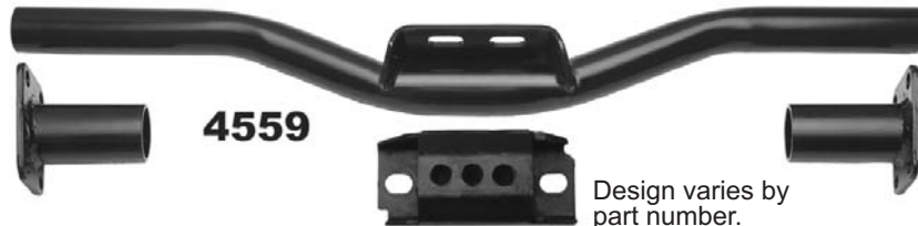
Design varies by part number.