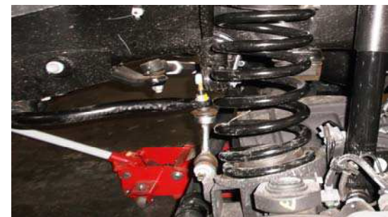
18. Reinstall the sway bar end links.