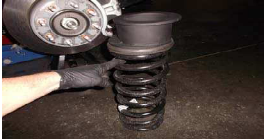
13. Install the OE spring isolator and the strut spacer onto the coil spring. Lower the axle further to allow spring installation.