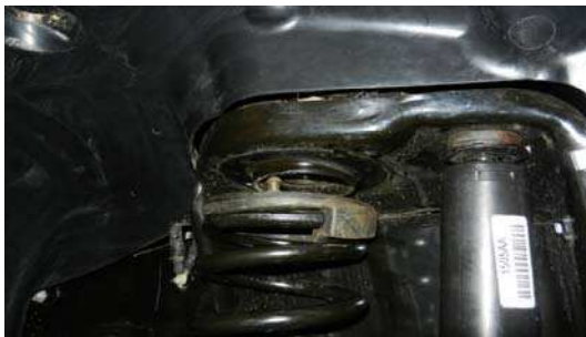
9. Lower the axle down to allow the front coil springs to be removed.