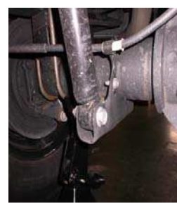
28. Reattach the shocks to the axle and frame.