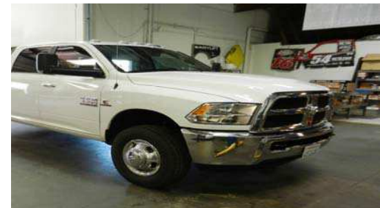
20. Torque the front wheels to factory specs.