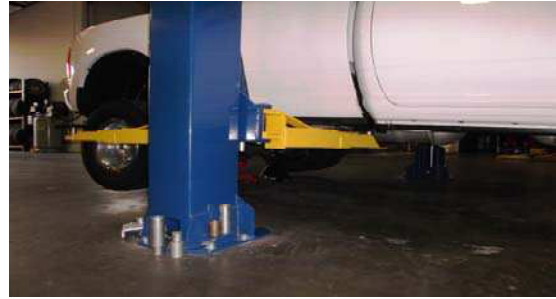
22. Lift the rear of the vehicle off the ground by the frame.