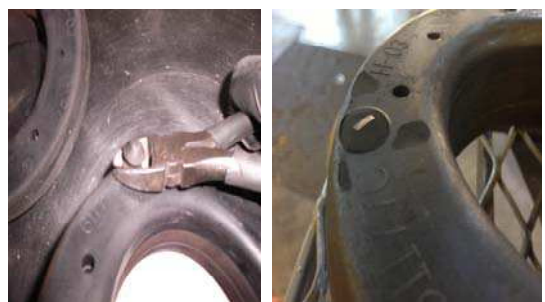
12. On OE spring isolator, cut off the rubber locating tab.