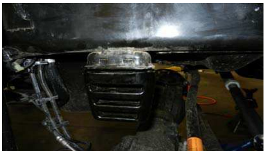
11. Install the ReadyLift 3" bump stops.