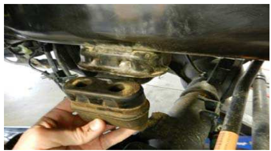
10. Remove the factory bump stops from the frame.