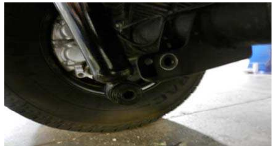
24. Unbolt the shocks from the frame and axle, then remove.