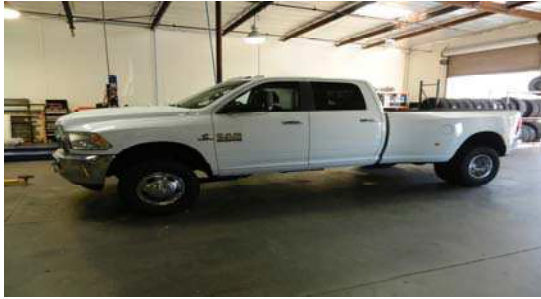
21. Rear Install: Place the vehicle on level ground.