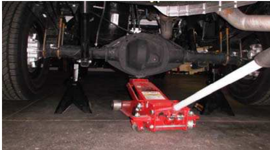
23. Support the rear axle.