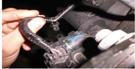
6. Unhook the wheel speed sensor wire line from the mount on the passengers side.