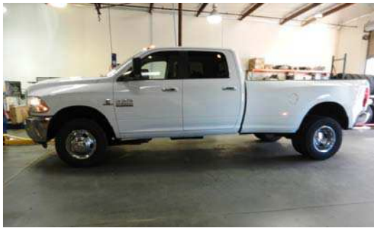
1. Front Install: Place the vehicle on level ground.

The Bill of Materials represents the component contents of this kit. All hardware is of the highest grade and the components are manufactured to exacting specifications for a trouble free installation. Use the attached torque specifications chart when final tightening of the nut and bolts are done.