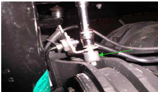
17. Install the brake line spacers using the longer bolts provided.