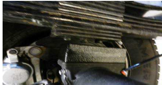
26. Lower the axle to make room to install the lift block.