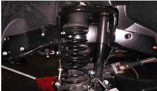
15. Raise the axle to weight the springs.