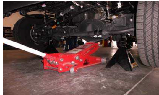
2. Lift the front of vehicle by the frame, then support the axle.