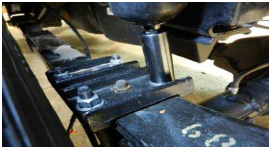
25. Unbolt the u-bolts and mounting plate from the axle.