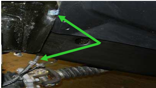
7. Unhook the differential breather tube from inside of the frame.