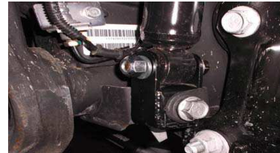
16. Install the shock extensions.