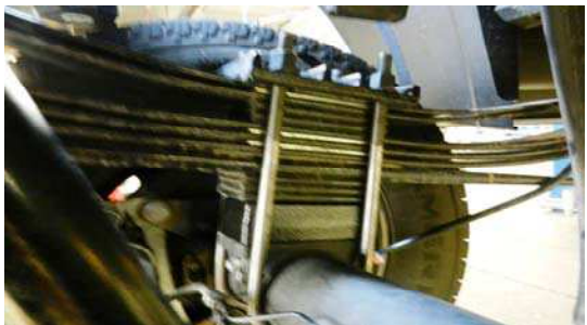
27. Install the mounting plate and longer u-bolts.