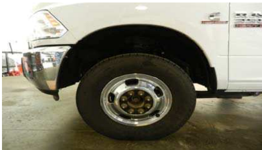
19. Reinstall the front wheels and put the vehicle on the ground.