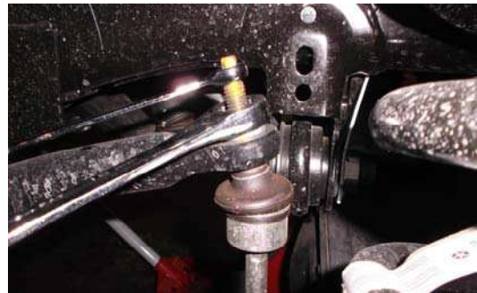
4. While front axle is supported, remove the sway bar end links.