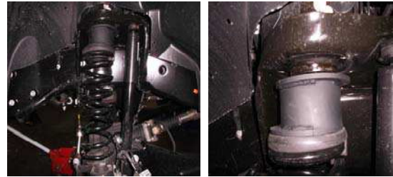
14. Install the assembly in to the vehicle. Note: Coil Spacer position. Coil Spacer Should be orientated so the spring is offset to the front of the coil pocket and to the inside of the frame to correct "Spring Bowing"