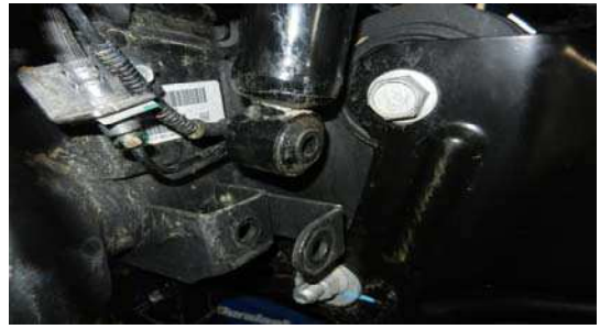
8. Unbolt the front shocks from the axle. Leave the tops bolted.