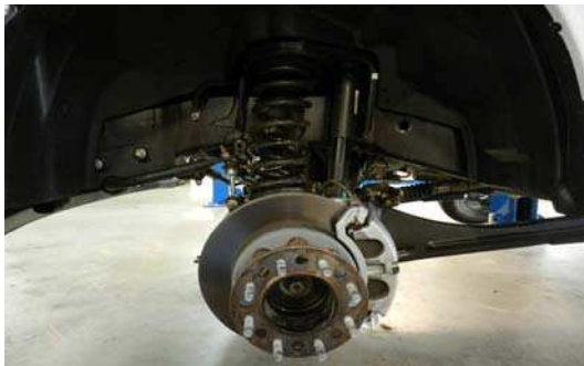
3. Remove the front wheels.