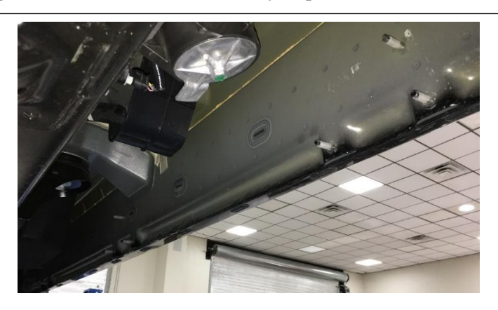
<u>Step 3:</u> On the inside rocker panel there will be three-attachment point consisting of three 8mm studs coming out from the panel. These studs may be covered in paint and will need to be cleaned before the installation.