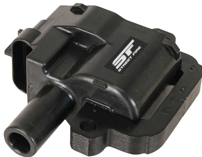
LS1/6, '98-'06, PN 5508/PN55088

There are several versions of LS coils, it is important to verify the correct coil for your application.