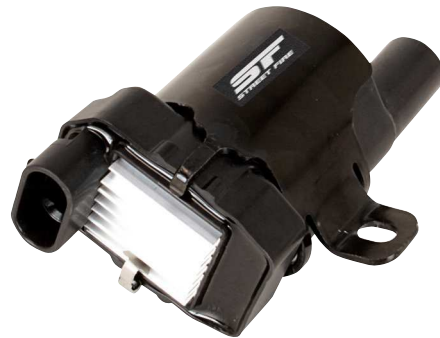
L-Series Truck '99-'07, PN 5509/PN 55098