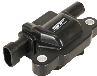
LS2/3/4/7/9, '05-'13, PN 5511/PN 55118