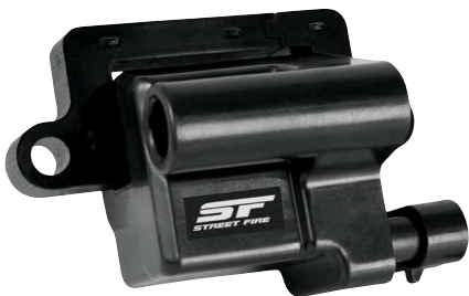
L-Series Truck, '99-'09, PN 5510/PN 55108