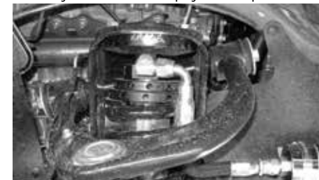
Fig. 2: Passenger side

the upper control arm and lower the suspension to allow the removal and installation of your shock assembly. Be careful not to damage any brake lines or electrical wires.