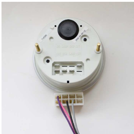
Electric Speedo with lower row terminals