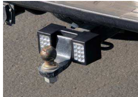
Figure 1 shows a hitch with a angled end. If this is the style hitch you have be sure to insert the longest part first or the Hitch Light will not slide onto the hitch.

Figure 2 Shows a hitch with a straight end. The Hitch Light will slide onto this no problem.