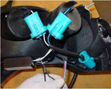
Step 11: Connect the red and blue wires together and black with black for halos and led.