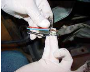
Step 12: Splice the red/blue wire with the power (brown) and black with the black on the corners