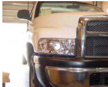
Step 15: Bolt on the headlight and check all functions before driving.