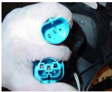
Step 10: Plug the supplied 2 to 1 wire harness into the new Anzo head light.