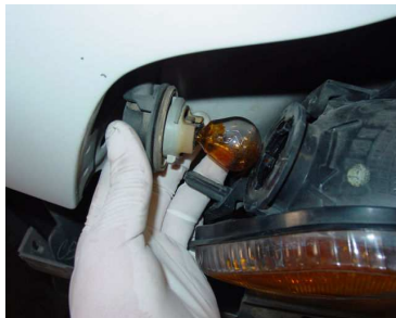
Step 14: Plug in the corner light.