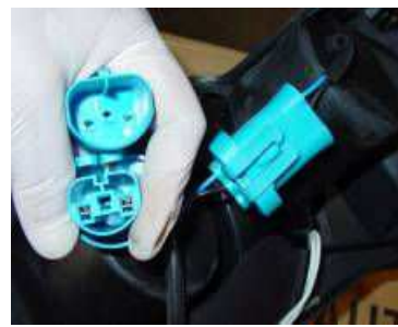
Connect the high beam and low beam plugs, check connectors for proper install.