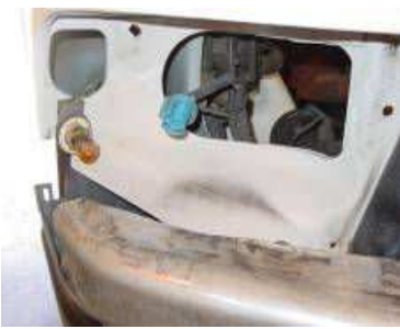
Step 9: Remove the headlight from the car.