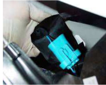
Step 13: Plug the headlight wire harness into the original headlight harness.