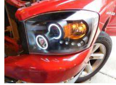
Step 16: Please test all functions making sure they work properly before driving.

AnzoUSA™ products are covered, by a limited one (1) year warranty, to be free of manufacturer's defects. However, certain AnzoUSA™ product categories have warranty policies which differ from this standard, please contact your representative for detailed category information. Damage due to improper installation or road hazards is not covered. Seller and manufacturers' only obligations shall be to replace the product proven to be defective. Neither seller nor manufacturer shall be liable for any injury, loss or damage, direct or consequential, arising out of the use of or the inability to use the product. Before using, user shall determine the suitability of the product for its intended use, and user assumes all risk and liability whatsoever in connection therewith.