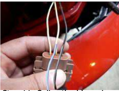
Step 11: Splice the blue wire into the middle white/green wire and the black to the black wire to power the halos.