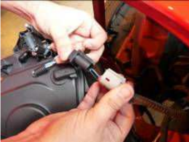
Step 14: Connect the head light wire harness into the new head light.