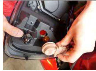
Step 13: Twist the corner parking into the new head light.