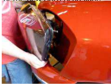
Step 15: Put the new head light into the vehicle and reverse steps to put the light back in.