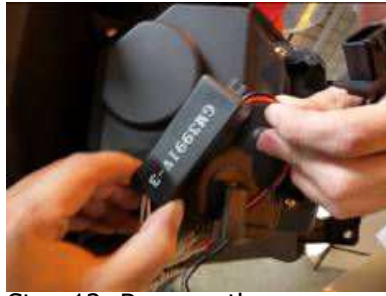
Step 12: Remove the protective plastic on the resistor and stick on the back of the new Anzo head light.