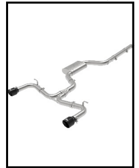
Cat-Back Exhaust System