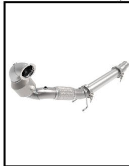
Street Series Down-Pipe