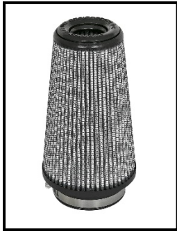
Pro DRY S Air Filter