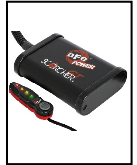
Scorcher GT Power Module