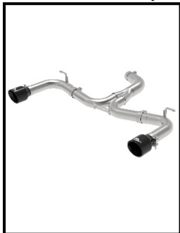
Axle-Back Exhaust System