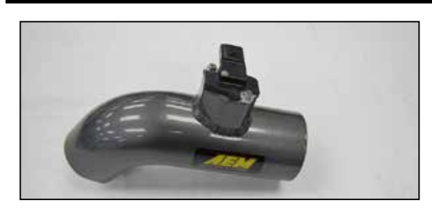
9. Remove the MAF sensor from the factory housing and install the sensor into the AEM® intake tube.