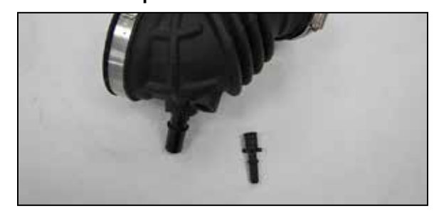
15. Move vent line fitting from stock intake tube.

NOTE: Plastic NPT fittings are easy to cross thread. Install the vent fitting "hand" tight, then turn it two complete turns with a wrench.