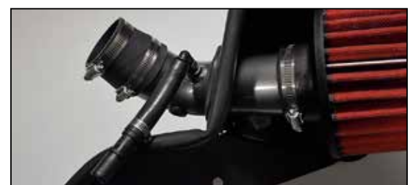
16. Install AEM® intake tube onto heat shield, then install NPT fitting and assemble the hose and quick connect fitting as shown.

NOTE: Plastic NPT fittings are easy to cross thread. Install the vent fitting "hand" tight, then turn it two complete turns with a wrench.