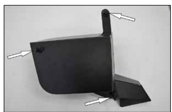
13. Install factory push in mount and the 2 AEM® air box mount to heat shield.