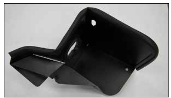
14. Install edge trim onto heat shield as shown. NOTE: Some trimming may be necessary.