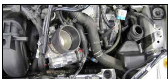
17. Install AEM® coupler on the throttle body as