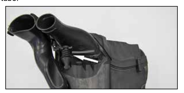
12. Remove factory push in mount from stock air box.