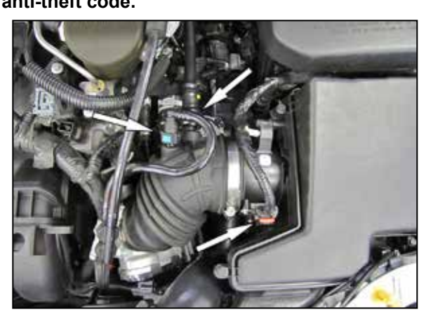
2. Disconnect MAF sensor, vent line, and crank case line from stock intake tube.

NOTE: Disconnecting the negative battery cable erases pre-programmed electronic memories. Write down all memory settings before disconnecting the negative battery cable. Some radios will require an anti-theft code to be entered after the battery is reconnected. The anti-theft code is typically supplied with your owner's manual. In the event your vehicles anti-theft code cannot be recovered, contact an authorized dealership to obtain your vehicles anti-theft code.