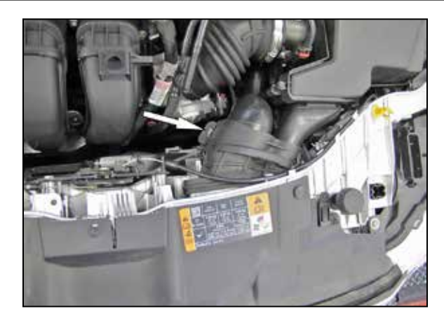
3. Release rubber strap for intake duct.