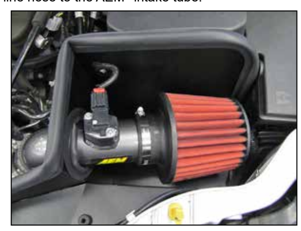
20. Route the MAF sensor wire harness through the heat shield cut out, then reconnect MAF sensor.