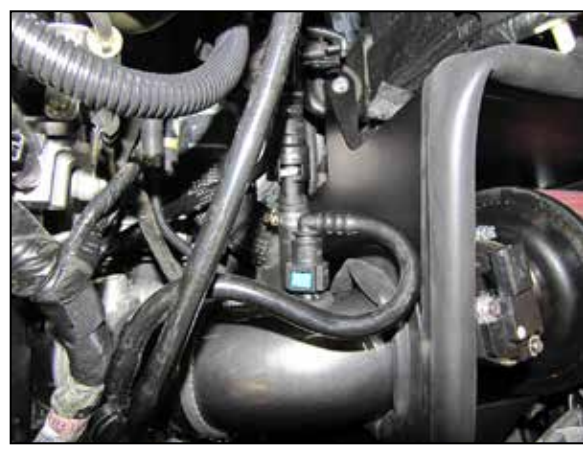
19. Install the supplied guick connect fitting onto NPT fitting, then reconnect crank case and vent line hose to the AEM® intake tube.