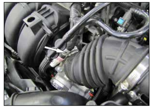
4. Loosen hose clamp on the throttle body.