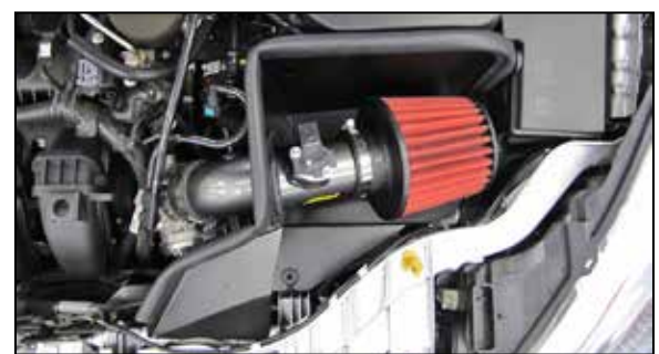
Install the AEM<sup>®</sup> intake system in the vehicle.