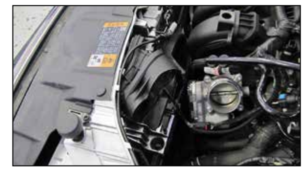
6. Pull on rubber intake duct to remove from vehicle.