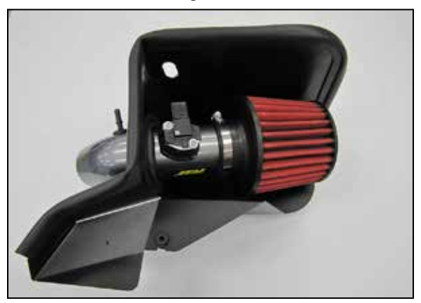
15. Install the factory vent fitting into the grommet as shown.