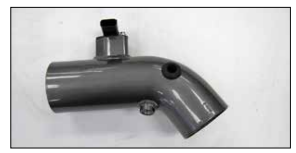
10. Install rubber grommet into AEM® intake tube.