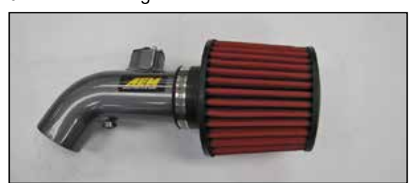
11. Install AEM® Dry Flow filter onto AEM® intake