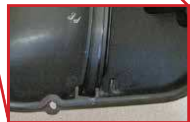
detail of sealing groove